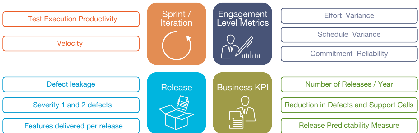
Figure 2. DevOps Quality Metrics Model